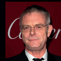
Stephen Daldry The Crown, Stranger Things: The First Shadow