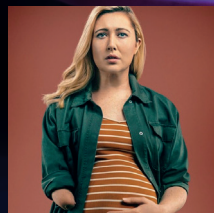
Melissa Johns Life, Granchester