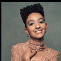
Patricia Allison Sex Education