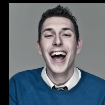
Blake Harrison The Inbetweeners