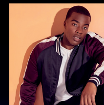
Daniel Ezra All American