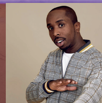
Kiell Smith-Bynoe Ghosts, The Great British Sewing Bee