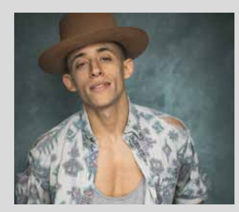
The Old Vic's A Monster Calls. National Theatre's Peter Pan