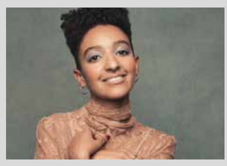
PATRICIA ALLISON Sex Education