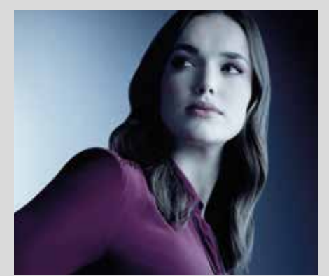
ELIZABETH HENSTRIDGE Agents of Shield