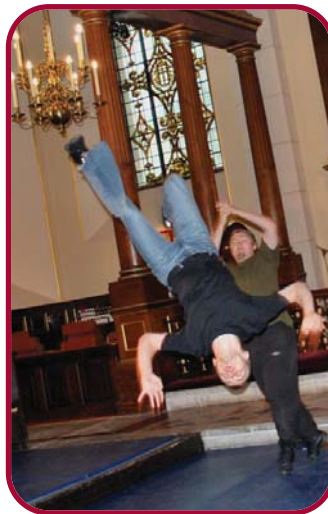
BA Specialist Performance Skills (Stage Combat) showcase at St Paul's Church

During their training, students on BA Specialist Performance Skills (Stage Combat) performed at Shakespeare's Globe, The Blue Elephant Theatre, Covent Garden Market and Heaven nightclub, so their showcase was a chance to see them demonstrate a range of their skills in one location in a short space of time. BA Community Theatre students also stayed at The Unicorn Theatre for the week after their showcase, undertaking a successful run of their own work with the local community.